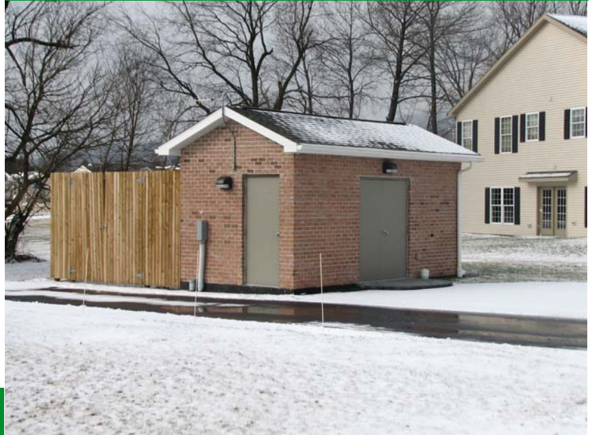
Ashford Manor Subdivision – Pump Station Centre Hall, PA